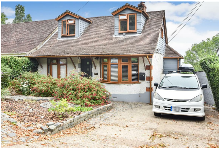
Off street parking and flower beds.