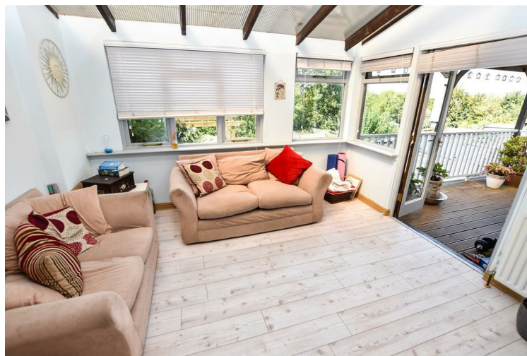
Conservatory 12 x 12 (3.66m x 3.66m)

Window to rear overlooking the garden and double doors to enclosed decked sun balcony, radiator, wood laminate flooring, built in cupboard housing wall mounted gas boiler approx 5 years old and serviced yearly. SUN BALCONY. Enclosed decked area enjoying a lovely outlook and having steps down to the garden