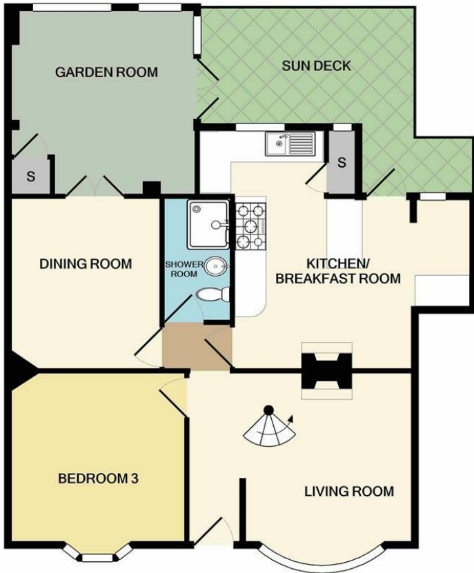
GROUND FLOOR APPROX. FLOOR AREA 790 SQ.FT. (73.4 SQ.M.)