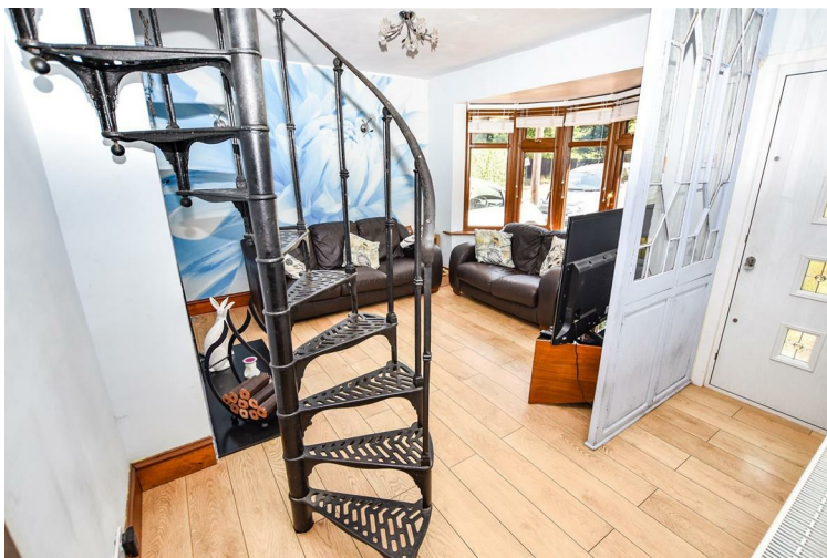
Lounge 14'4 x 14 red 11'2 (4.37m x 4.27m red 3.40m)

Composite door, bay window to front, iron spiral staircase, two wall light points, two radiators, wood laminate flooring, recessed multi fuel burner.