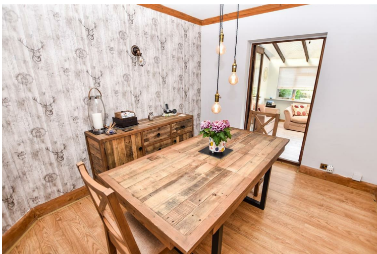
Dining Room 11 x 9'9 (3.35m x 2.97m)

Double doors to conservatory, wood laminate flooring, radiator, wall light point.